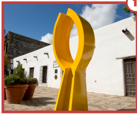
1. Spanish Governor's Palace 105 Plaza De Armas