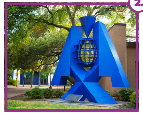
2. Universidad Nacional Autonoma de México 600 Hemisfair Plaza Way