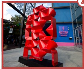
3. Centro de Artes 101 S. Santa Rosa