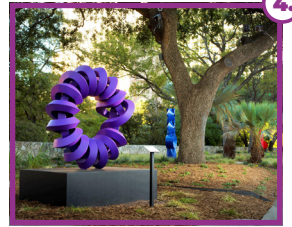
4. Riverwalk Public Art Garden Near 200 block of E. Market St.