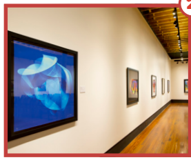
2. Culture Commons 115 Plaza De Armas