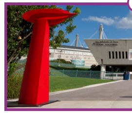
1. Institute of Texan Culture 801 E. César E. Chávez Blvd.