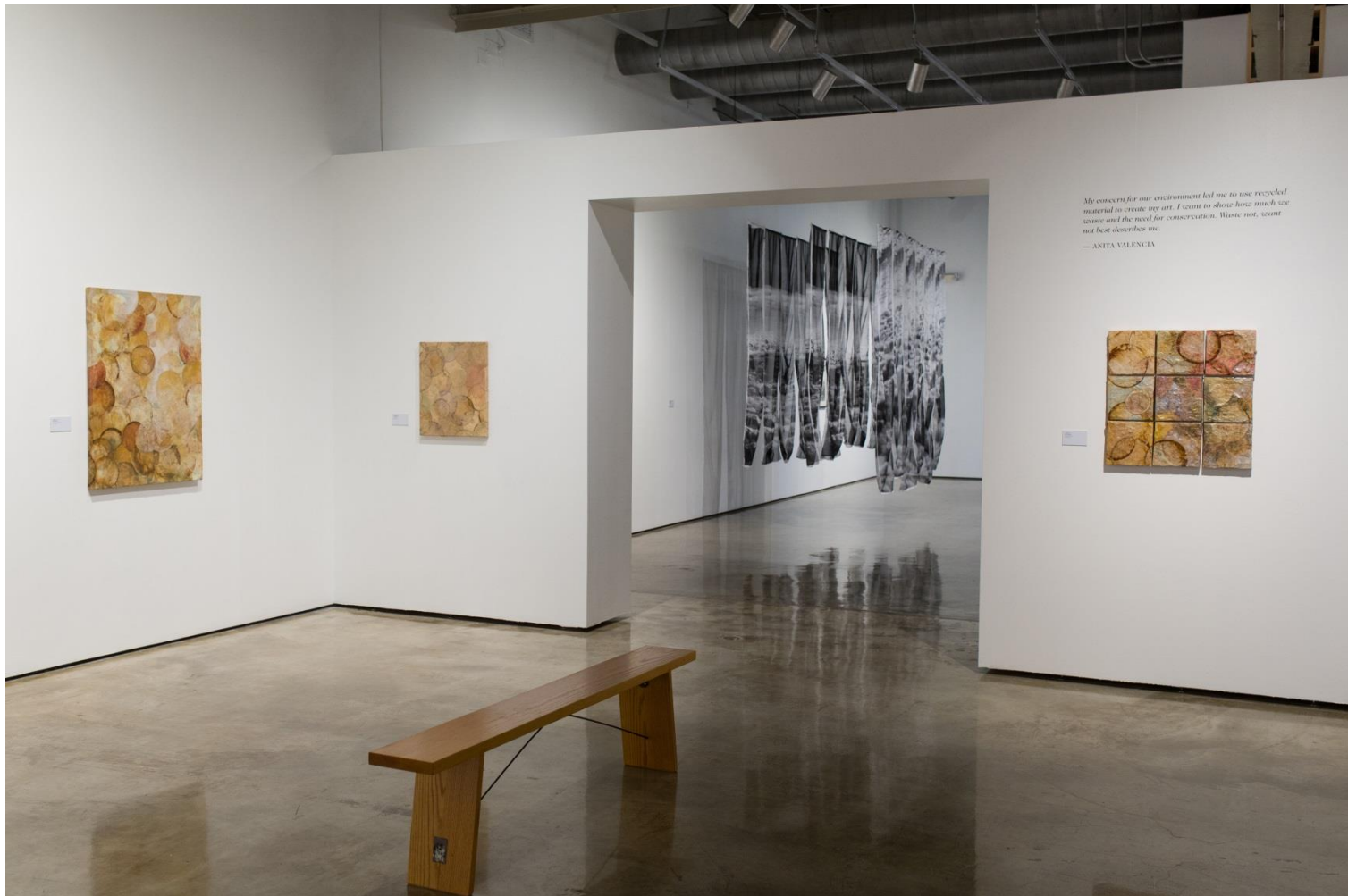
From A Woman's Place Is...