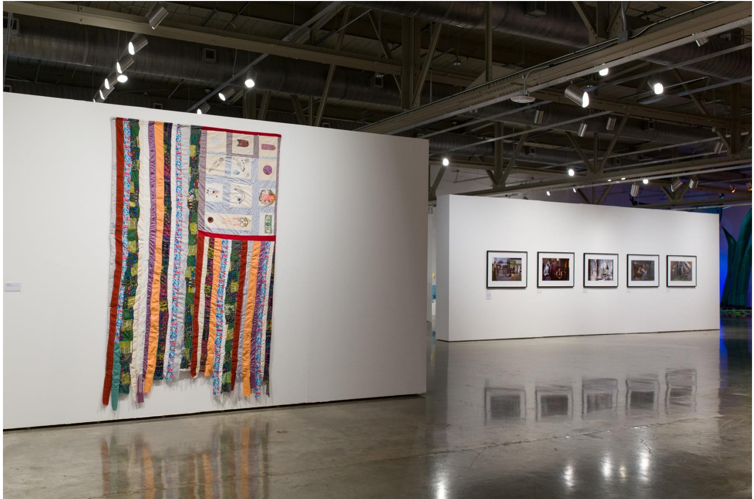
From A Woman's Place Is...