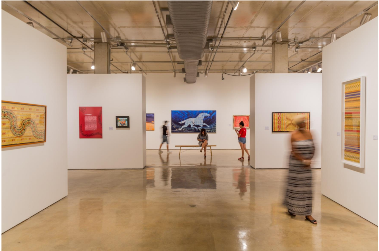
From Icons & Symbols of the Borderland